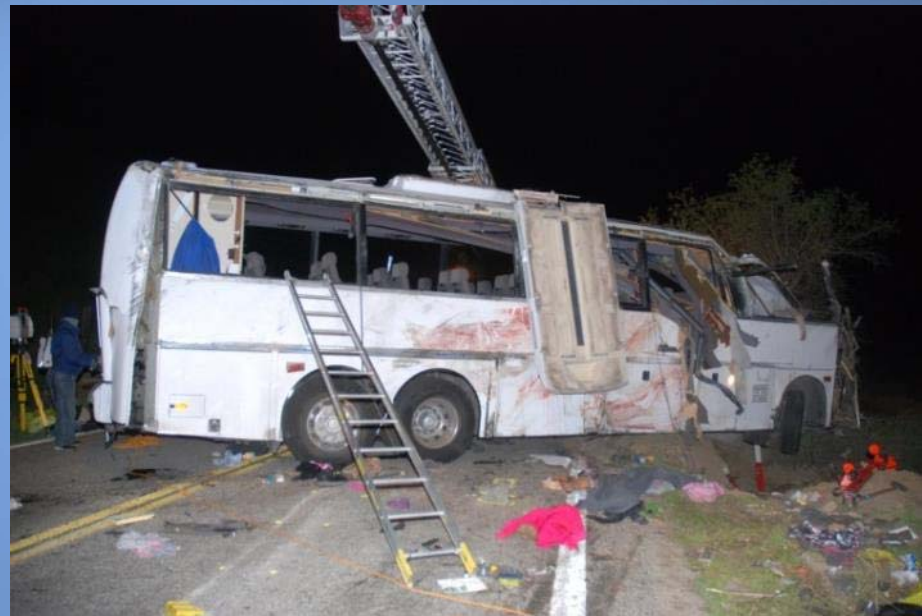
San Bernardino, CA 2/3/2013