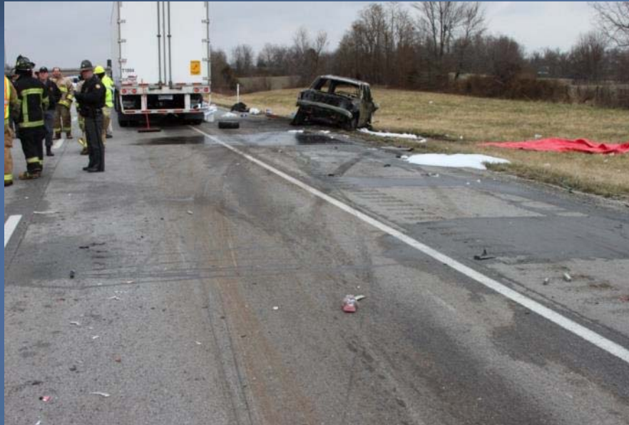
Elizabethtown, KY 3/2/2013