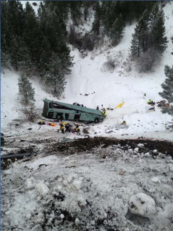
Pendleton, OR 12/30/2012