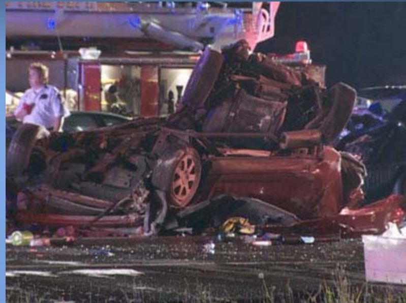
Murfreesboro, TN 6/13/2013