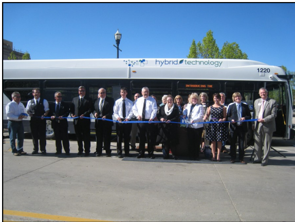
MATBUS in Fargo, ND, recently unveiled four new state-of-the-art hybrid buses. These 40-foot buses were on display at the "Buses in Black Ties" event May 23 in downtown Fargo.

For more details about the project, contact Del Peterson at del.peterson@ndsu.edu