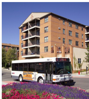
Metro Area Transit Bus

environment influences one's travel mode choice. Planners need evidence showing how land use matters as they advocate for the adoption of different