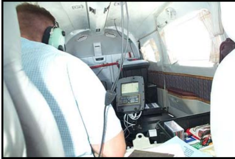
Figure 3 Airborne remote sensing mission in progress over the Winnebago Reservation.

Facility is currently the only full-time operating platform in the United States. Since