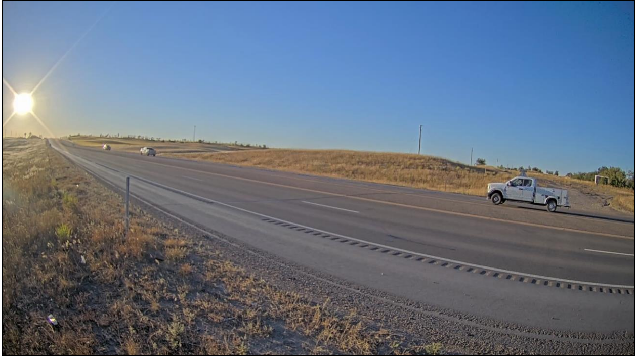
Figure 9. Example of a commercial vehicle with utility body