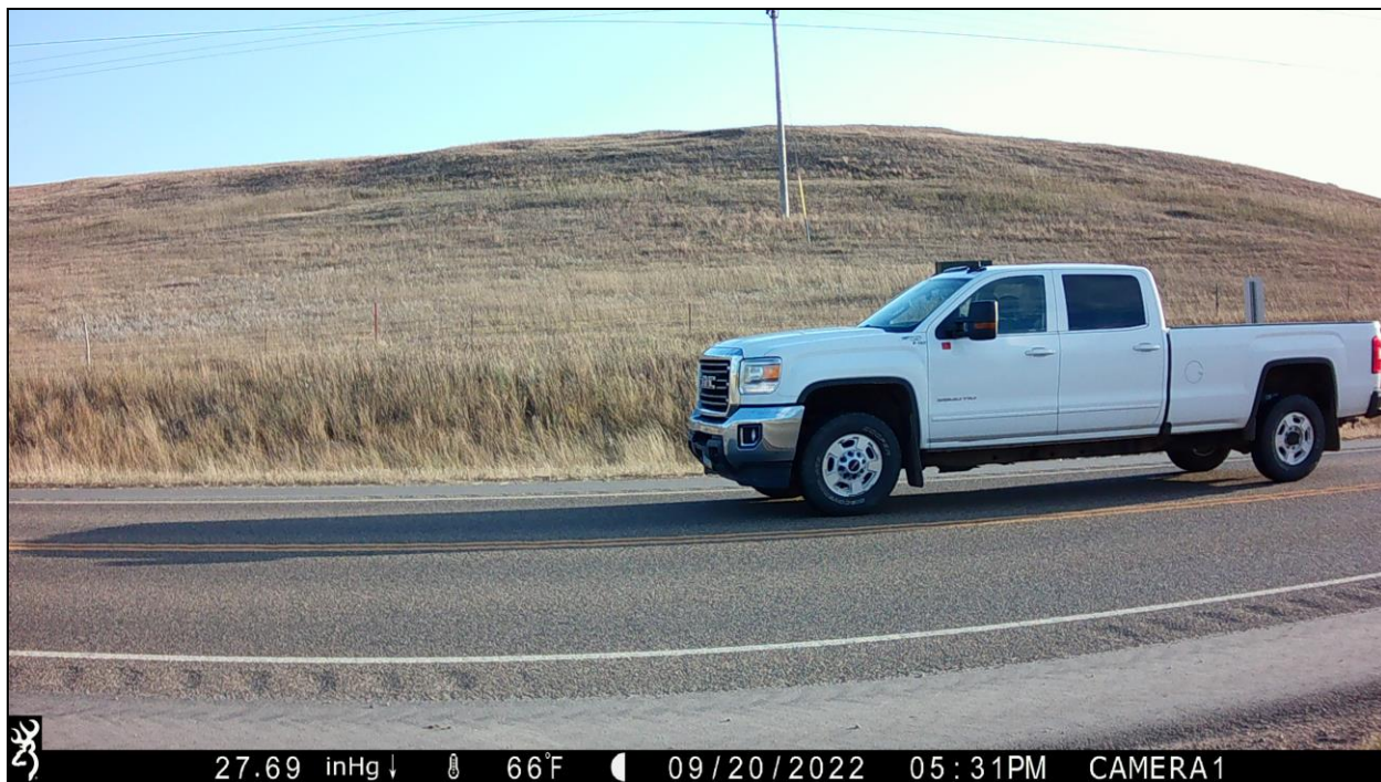
Figure 5. Example of a commercial vehicle with non-factory reflective marker