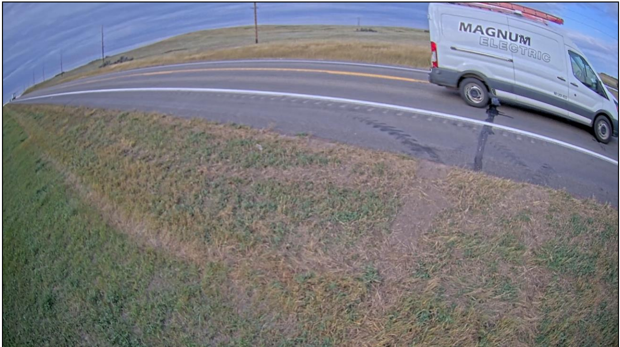
Figure 2. Example of a vehicle with company decals on the side

The commercial vehicles were then scrutinized further to determine front-seat passenger occupancy. Figures 2 through 12 below show examples abovementioned categories.