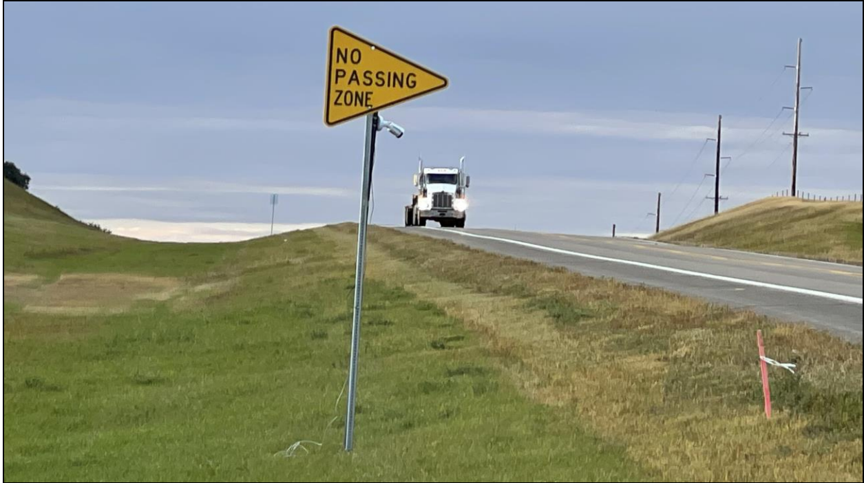
Figure 1. Example of a camera setup

A vehicle was categorized as commercial if it met at least one of the following conditions: