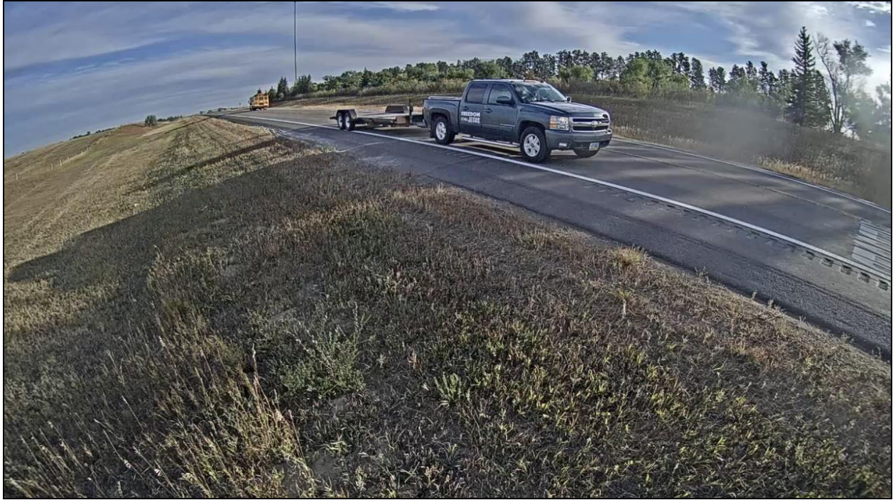
Figure 7. Example of a commercial vehicle with company logo towing utility trailer