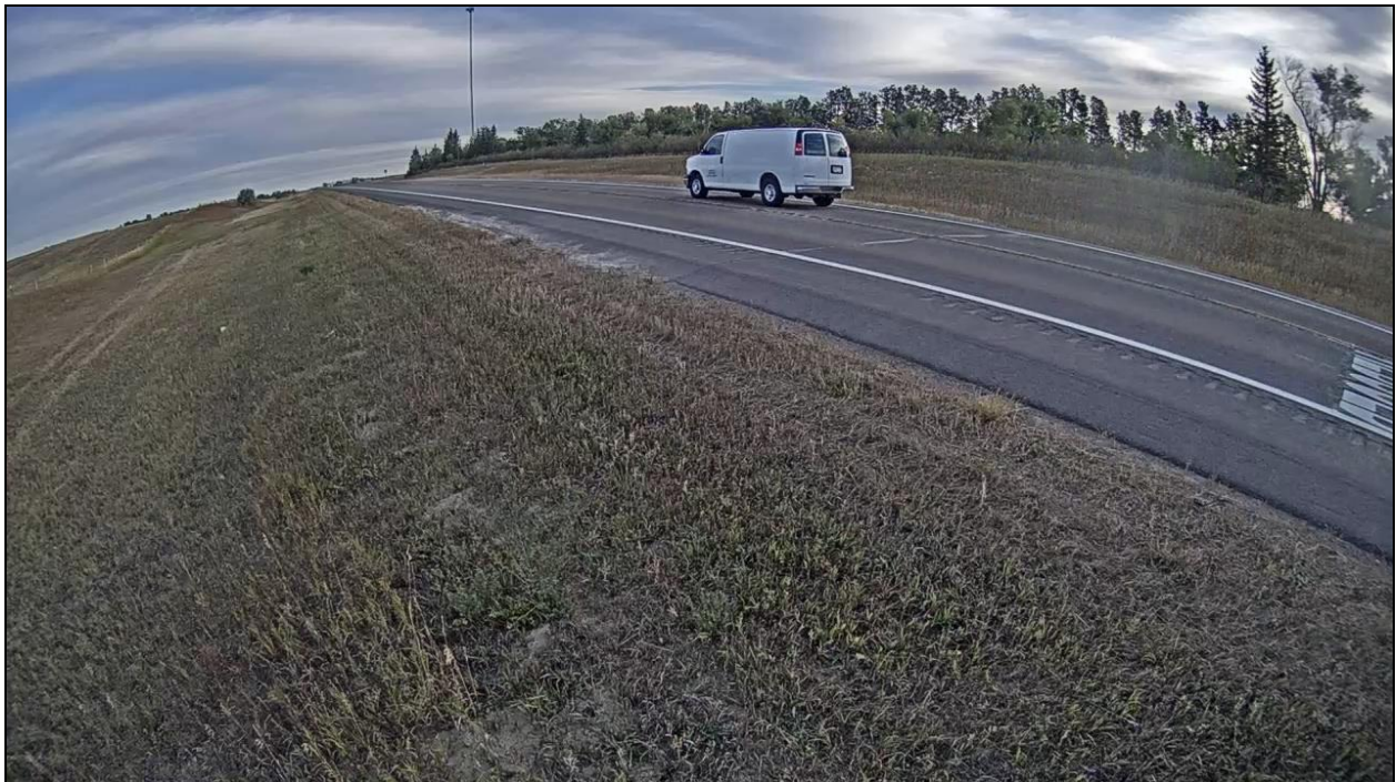
Figure 8. Example of a commercial vehicle with decals