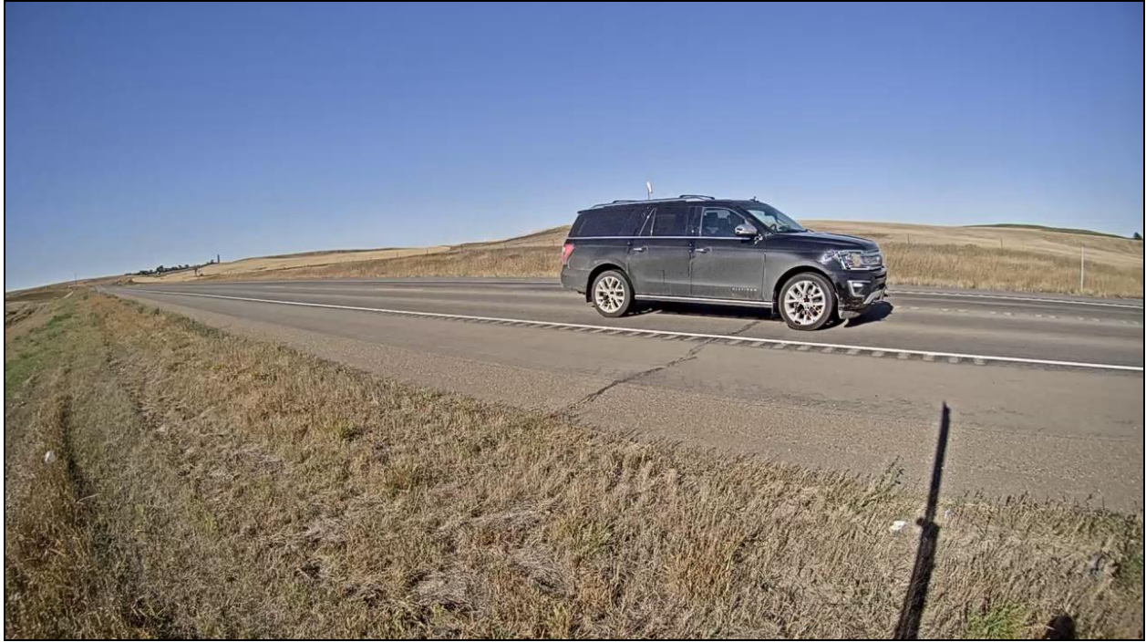
Figure 3. Example of a vehicle categorized as non-commercial