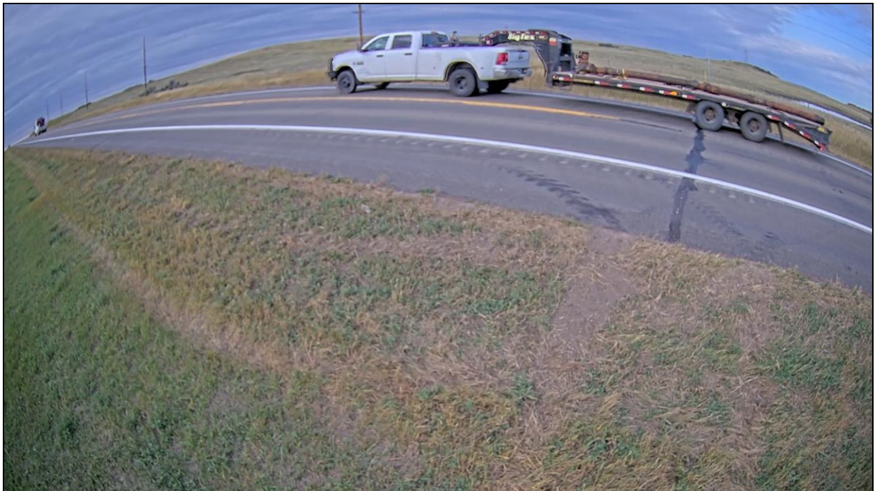
Figure 4. Example of a commercial vehicle with auxiliary fuel tank towing specialized trailer