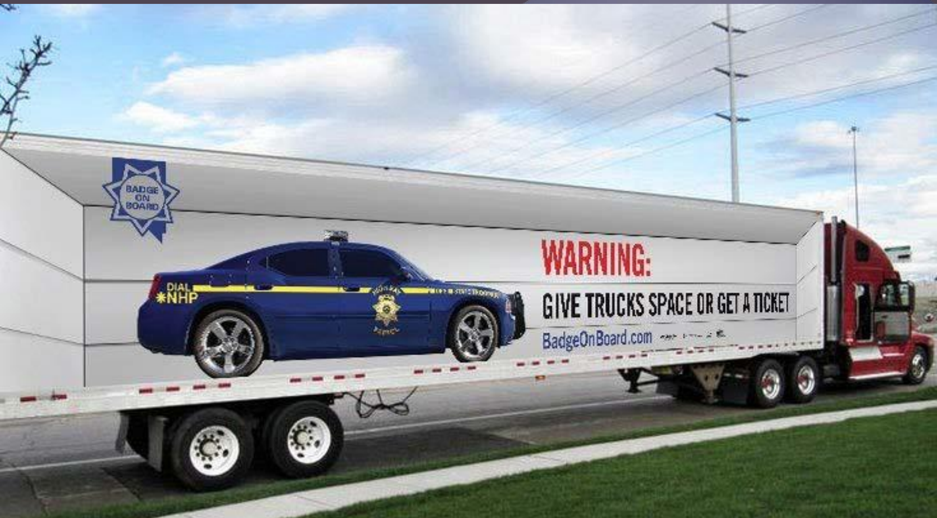
BOB trailer wrap