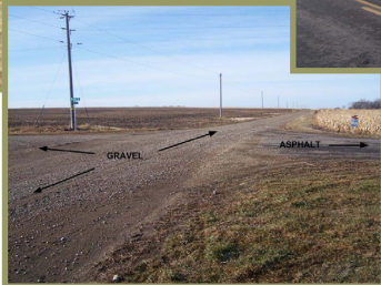
3. Both paved and gravel roadway composition