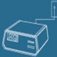
2. The SCRAM Modem