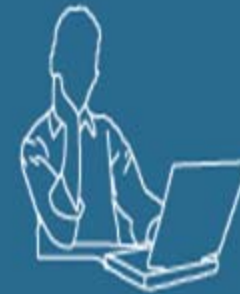
4. The Monitoring Center

Click an image to learn more about SCRAM