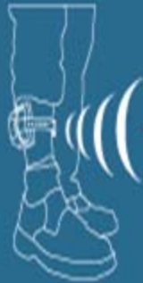
1. The SCRAM Bracelet