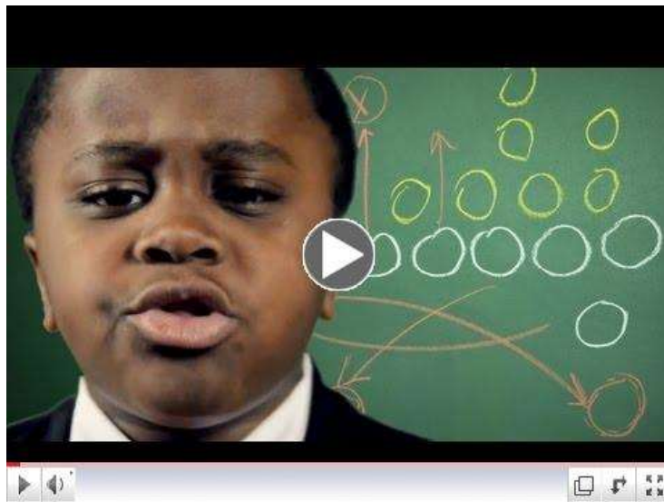
A Pep Talk from Kid President to You