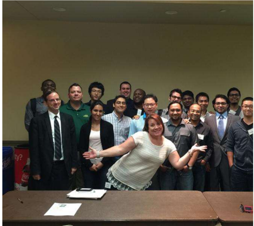
NDSU Transportation and Logistics Students at the Fall 2015 Student Orientation.